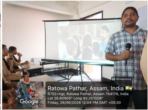
Activity 6: Representative awareness films display photos