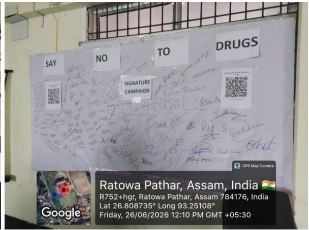
Activity 7: Representative signature campaign photos