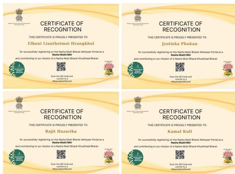
Activity 2: Representative Nasha Mukta Mitra certificates of volunteers