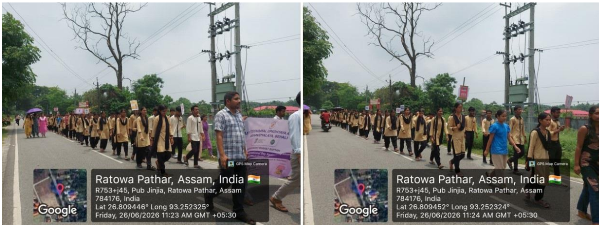
Activity 4: Representative rally photos