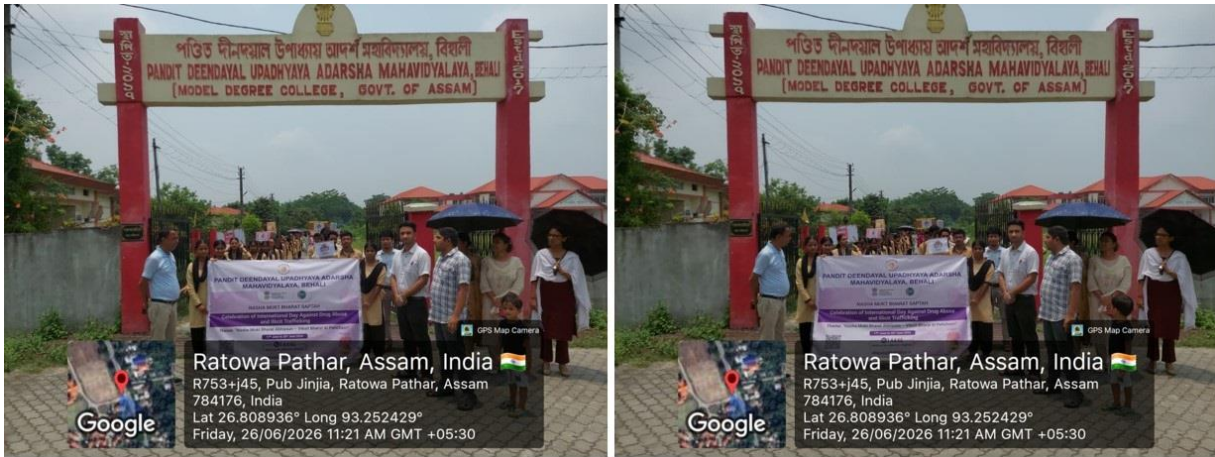
Activity 3: Representative inaugural session photos